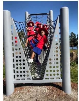
Rooms 1 & 2 students having fun on their bikes, iPads and playing!